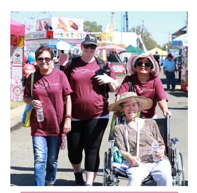
We went to the Grape Festival!