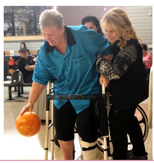
A rehab grad who achieved her goals went bowling!