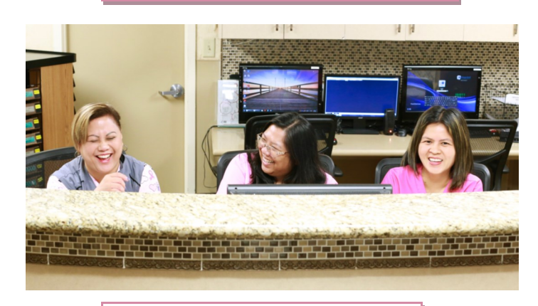
We had a photoshoot!