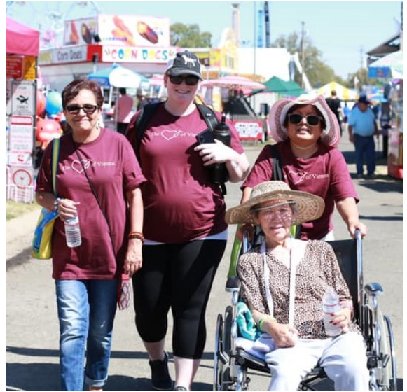
We went to the Grape Festival!