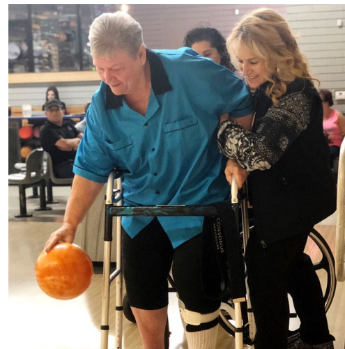
A rehab grad who achieved her goals went bowling!